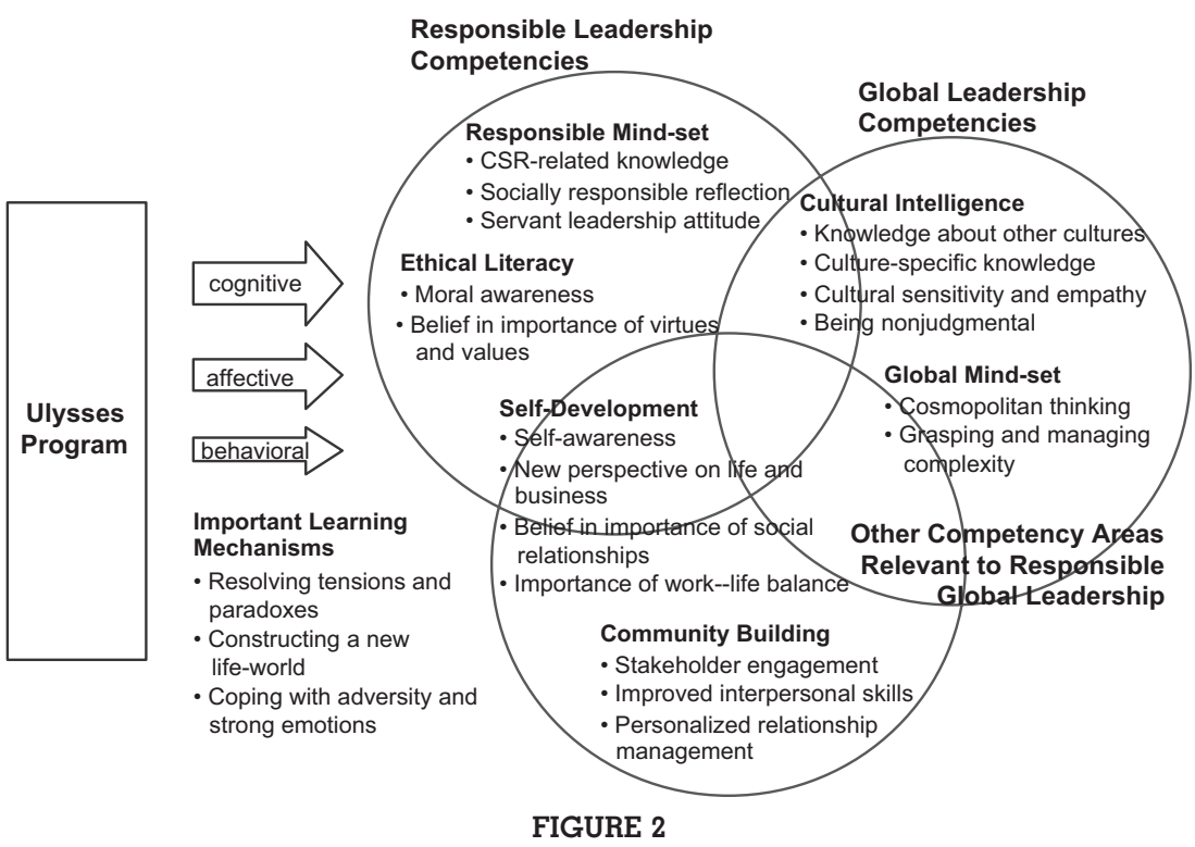
Synthesis of Key Findings of Content Analysis of Learning Narratives